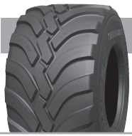
TWIN RADIAL for TRAILERS