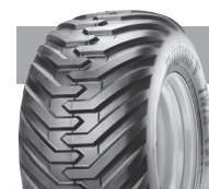
TWIN GARDEN TRACTOR