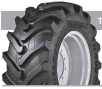
TRACTOR AGRO INDUSTRIAL