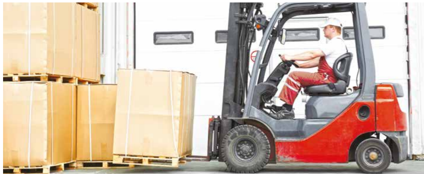
PRESS ON SOLID